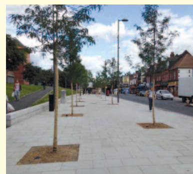
New Cricklewood Square